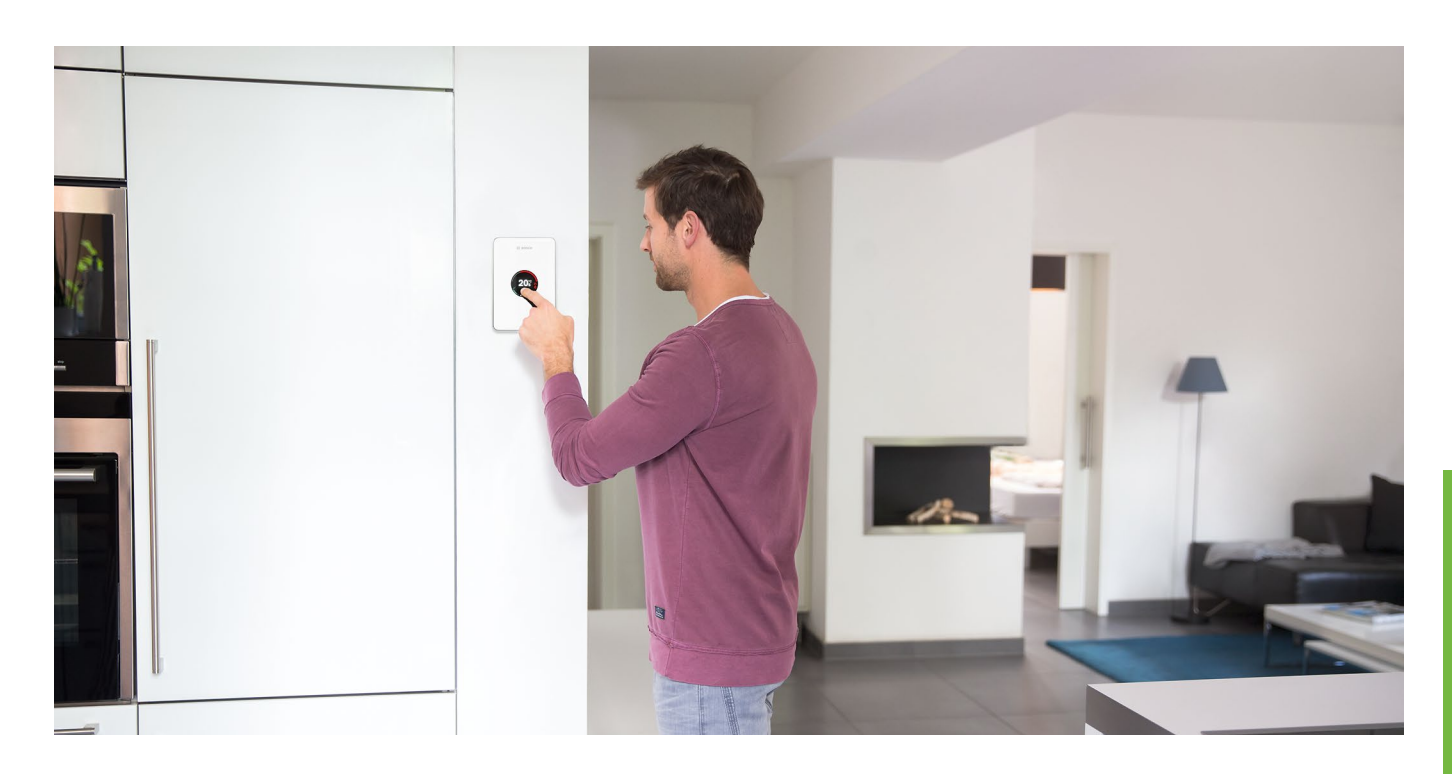
www.bosch-thermotechnology.com Solution provided by: Bosch Thermotechnology

Decentralized heat generation offers high energy-efficiency, operational reliability and low management costs. Decentralized solutions simplify billing according to consumption. As every heat generator has its own meter, the utilities provider can invoice energy costs directly to individual tenants. Every resident in the property can set the heating to their own preferences. Shorter supply lines mean lower heat losses.